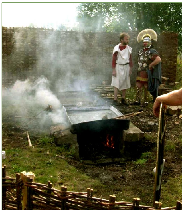
Recreation of a Roman salt works in Cheshire showing lead pans (By Neville and Fielding, 2005)

Roman water tanks: Twenty-eight Roman "Baptismal" lead tanks have been found in Britain (excluding the cistern base recently discovered at Rudston) and a further nine in Anglo-Saxon contexts (Crerar, 2012) although we will look at little more closely at this matter in a moment. In addition, both in the Roman and Anglo-Saxon periods, lead was used to make salt and brine boiling pans (Neville and Fielding, 2005) (Walker, 2000).