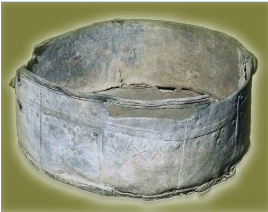
One of the Roman lead tanks found in Icklingham, Suffolk

The purpose of the lead tanks found in various locations, mainly in southern and eastern England, is not yet clearly settled. Some early work considering them discussed that they might be associated with Baptism, for which a number of suggested reasons were given including that some tanks had the chi-rho symbol (an X with a P through it) on them, regarded in the 1960s as an indicator that they had a religious significance and dating them to after AD 312, when the Emperor Constantine first used that Christian symbol on the shields of his legionaries at the Battle of the Milvian Bridge. This argument has taken hold of the discussion of the tanks in the years since and new finds have typically been referred to as "Baptismal Tanks" or "Lead Fonts".