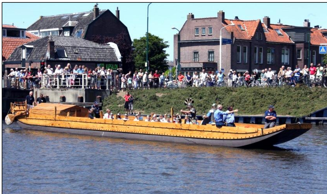
Replica Roman rowing and sail flat-bottomed barge constructed in the Netherlands

transport heavy loads would be possible but much slower than river transport. Coastal shipping was even cheaper, because it was possible to use bigger ships than on the rivers.