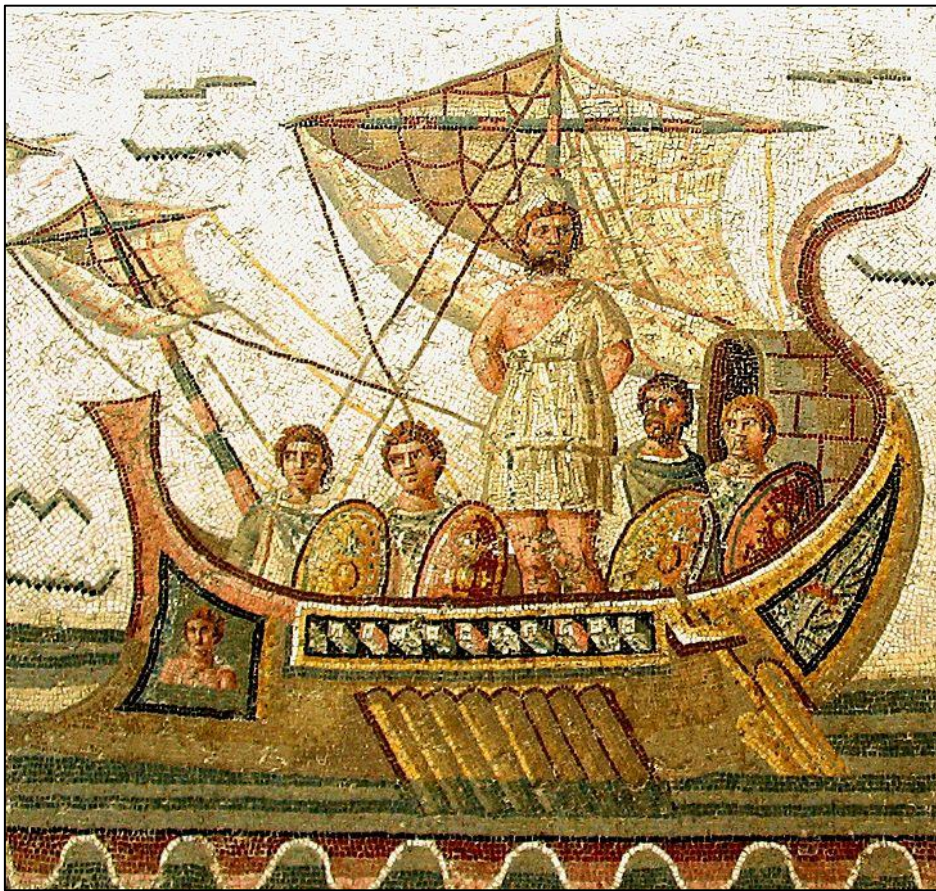
Roman ship from a mosaic in the Bardo Museum