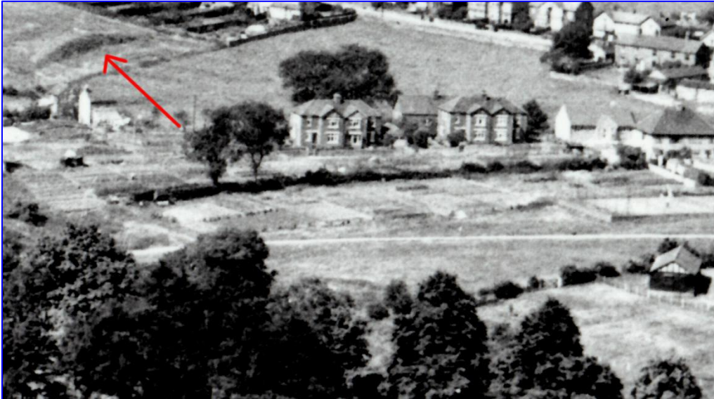
1963 Postcard showing banking in the field before the DLS garage was built

The next picture, taken in 1971, was from the old Wirksworth Heritage Centre in Crown Yard, where it had hung next to the stairs for 30 years. This shows some more curved banking (on the opposite side to the 1963 postcard) where Ecclesbourne Close now is. Again we mapped the banking and again, this feature appears to relate to the others.