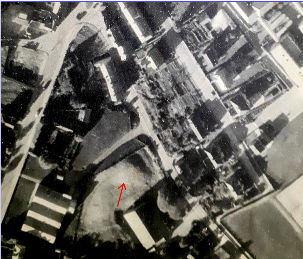
1971 aerial photograph showing the DLS garage (middle bottom)

At the time (2019/20) we were knee-deep in the Covid epidemic and in 2021 we were committed to work in the Meadows which continued until 2022. Finally, at the start of 2023, we revisited the pictures of the lemon shaped crop mark and its nearby curved banking and finally, with the kind help of the residents of Ian Avenue, we began investigating the one part of the site of the feature which may have survived, to try and identify what it was. We have a particular view, as stated in my Christmas message, but the certain identification of this feature will only become apparent if we can find standing archaeology (such as a wall - implied by the 1950 crop mark). Work will begin again after Easter.