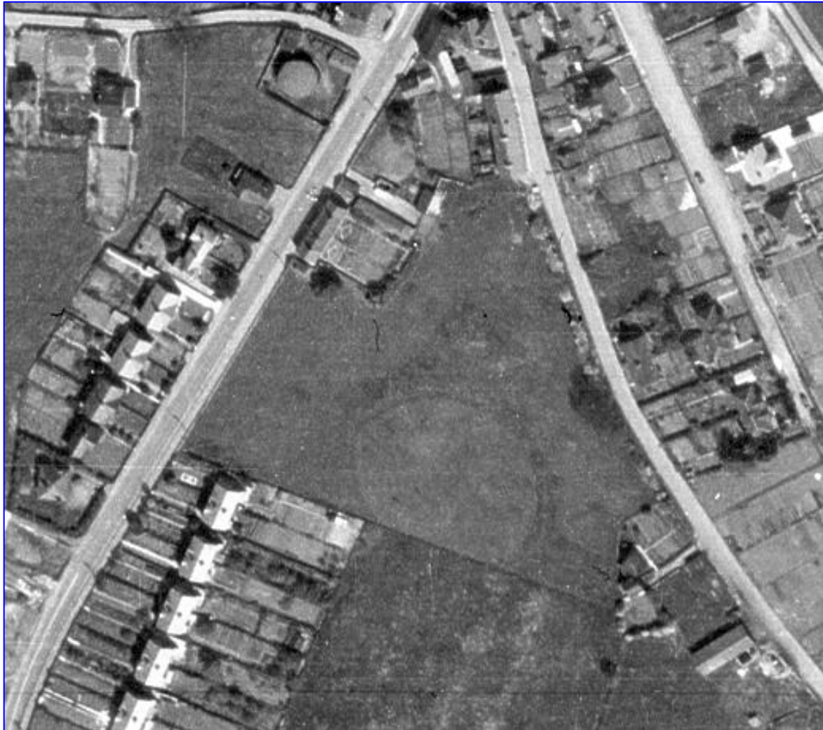
1950 aerial photograph with a lemon-shaped crop mark in the middle of the field

All of the area which was a field in 1950 has been built on and the site, as it was, is essentially destroyed by modern housing and industrial units at the former Bainware Factory (Courtaulds), DLS Water Lane, Ian Avenue, Ecclesbourne Close and The Hawthorns.