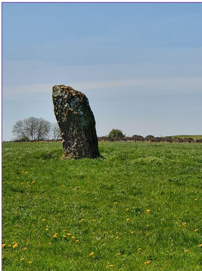
The Bradstone, looking approx west