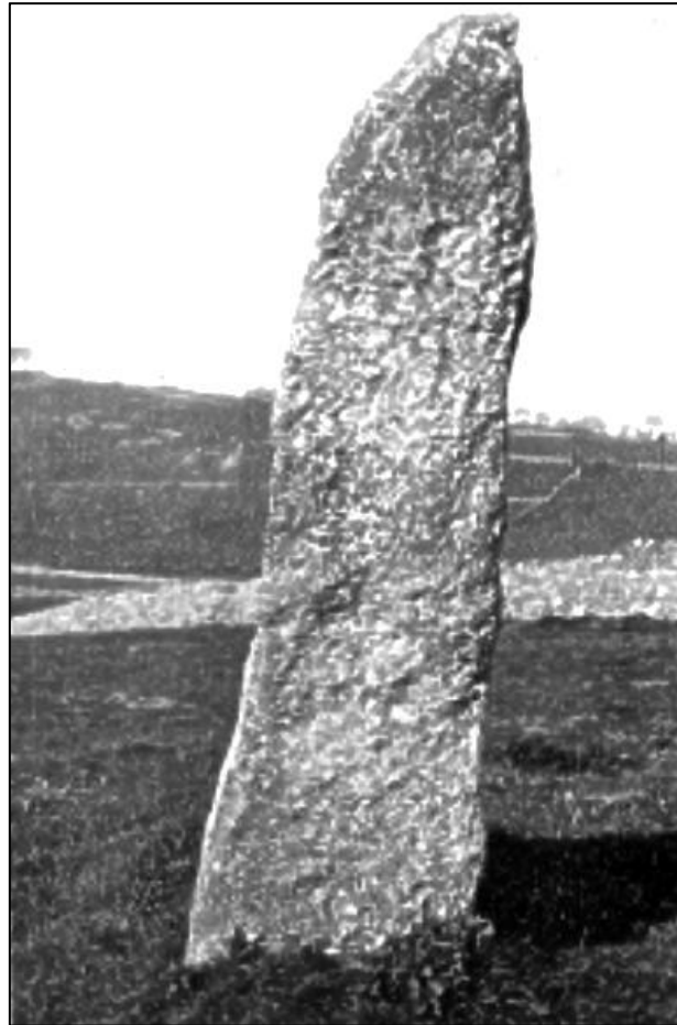
The Eastward Stone, image taken in 1915, looking north